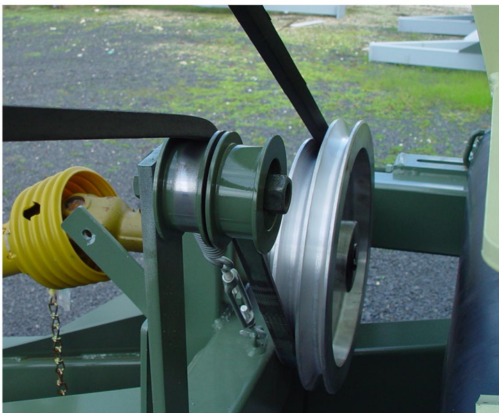
PTO Shaft Pulley

Ensure the vee belt is aligned with the drive pulleys and idlers.